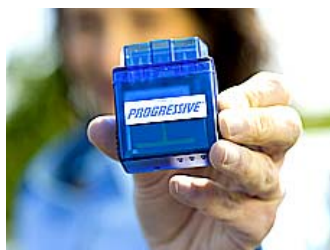
Progressive's MyRate device.