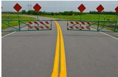
Progressive's patents are blocking drivers with other insurance companies from accessing "pay as you drive" policies.

Without question, he and others say, Progressive's patents have formed a barrier against adoption of usage-based insurance systems, leaving drivers with less choice and possibly bigger insurance bills.